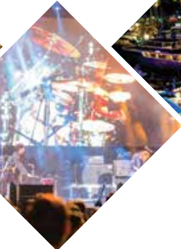
Christmas at Sentosa HarbourFront