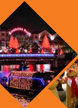
Christmas by the River