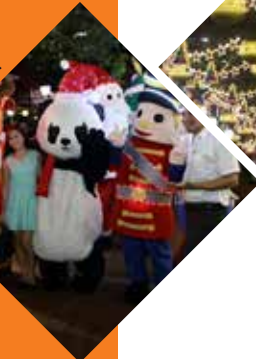
Christmas On A Great Street