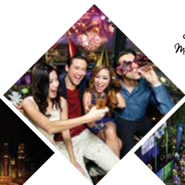
Year-end Celebrations at Faber Peak Singapore

2015 is coming to an end, and December is truly a month of merry-making. Partygoers will be spoilt for choice with not just one, but two beach bashes at Sentosa – ZoukOut 2015 and Siloso Beach Party. If family-friendly activities are on your itinerary, bring the little ones to the Singapore Zoo, River Safari, and Jurong Bird Park for heaps of wholesome fun. And what better way to end 2015 than taking part in the festivities at the Marina Bay Singapore Countdown 2016? Happy New Year, everyone!