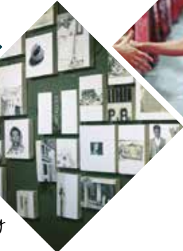
National Gallery Singapore