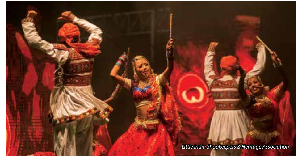
Little India Shopkeepers & Heritage Association

Each year, Hindus celebrate Deepavali (November 10) – the 'Festival of Lights' that marks the triumph of good over evil and light over darkness. Streets are decked out with dazzling lights; bold, bright colours are found in every corner and the atmosphere is buzzing. It's a huge festival across the world, and Singapore is no exception!